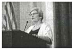
Testing Standards Senate Hill Briefing