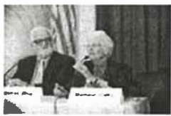
Testing Standards Senate Hill Briefing