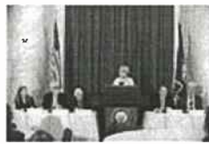
Testing Standards Senate Hill Briefing