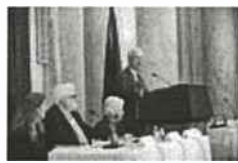
Testing Standards Senate Hill Briefing