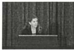
Testing Standards Senate Hill Briefing