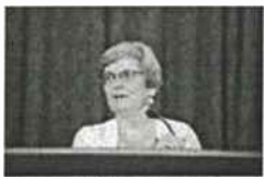
Testing Standards Senate Hill Briefing