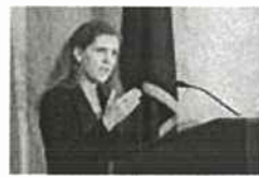
Testing Standards Senate Hill Briefing