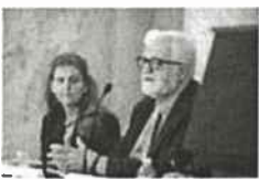
Testing Standards Senate Hill Briefing