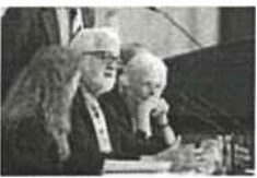
Testing Standards Senate Hill Briefing