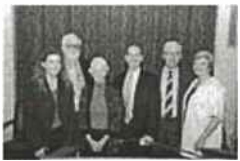
Testing Standards Senate Hill Briefing