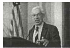
Testing Standards Senate Hill Briefing