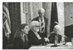
Testing Standards Senate Hill Briefing