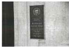
Testing Standards Senate Hill Briefing