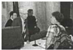
Testing Standards Senate Hill Briefing