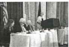
Testing Standards Senate Hill Briefing