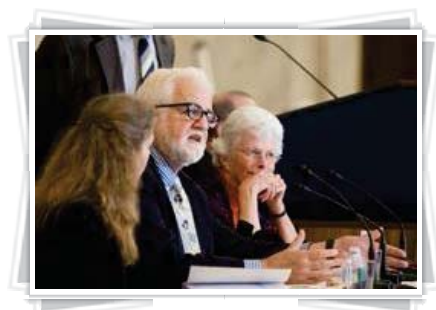
Testing Standards Hill Briefing Photo Gallery (19 Photos)