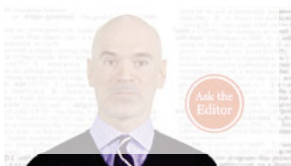
Webster's Dictionary of 1864