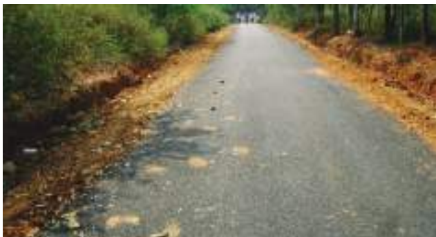
Photo 1 Rural Road Constructed Using C&D Waste by KRRDA Near Bengaluru