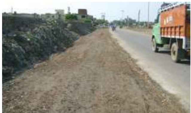
Photo 5 Cement Stabilised Base Course of C&D Waste Test Road