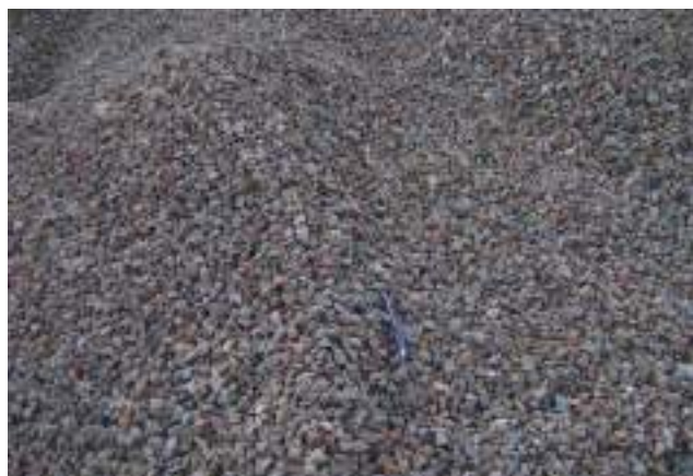
Photo 6 Coarse Aggregates Prepared from C&D Waste