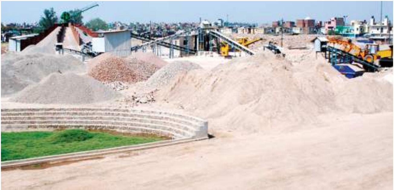
Photo 1 C&D Processing Plant at Burari in Delhi

Being the first such project of organised management of C&D waste in the country, it has set an example, which can be replicated by other cities in India.