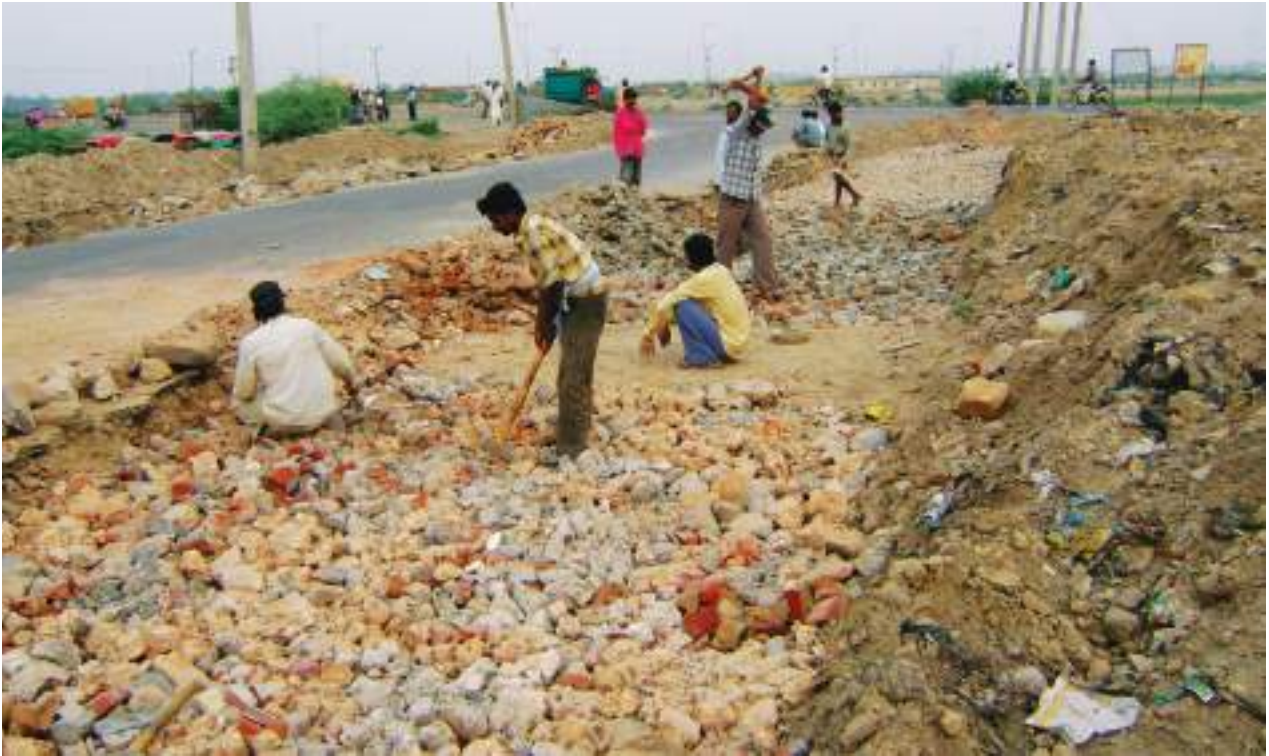
Photo 3 C&D Waste Being Manually Crushed for Test Road Construction in Delhi

Demonstration test road construction of about 150 m length involving usage of stabilised C&D waste in both bound as well as granular (unbound) form for base and sub-base course respectively, was taken up jointly by CRRI, IEISL and MCD in 2009 at Delhi. The work involved widening existing road pavement on both sides of the road. For sub-base, crushed C&D waste conforming to GSB gradation specified by MORTH was adopted. Over the granular sub-base, 150 mm cement stabilised base course (5 per cent cement admixture) was laid. For mixing cement with crushed C&D waste, tractor towed disc harrow was used ( Photo 3, 4 and 5 ). The pavement cross adopted is shown in Fig 2. Performance of this stretch monitored over a period of two years was very good.