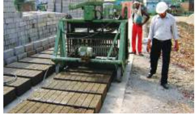
Photo 8 (a) and 8 (b) Preparing Value Added Products from C&D Waste