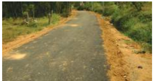
Photo 2 Another View of Rural Road Constructed Using C&D Waste