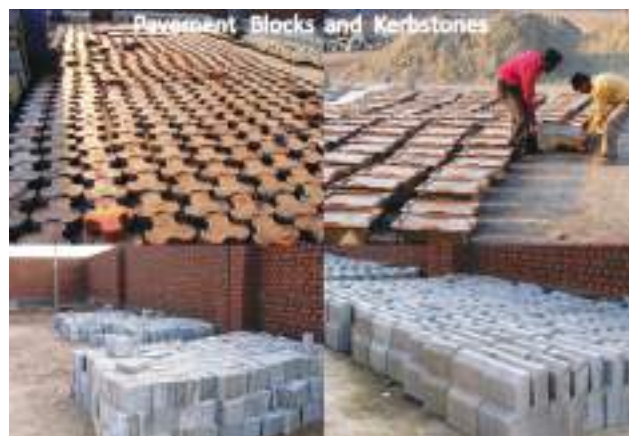
Photo 5 Value added products