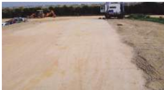
Photo 9 PQC Pavement Constructed Near the Plant Using C&D Waste (RA)