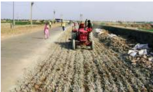
Photo 4 Cement Stabilisation of C&D Waste for Test Road Construction