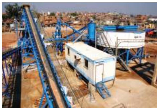
Photo 4 C&D Wet Processing Plant