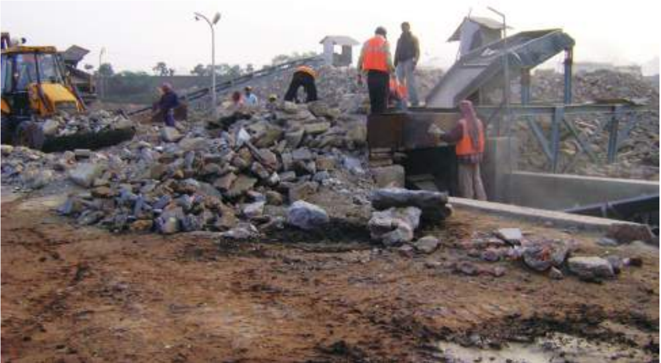
Photo 3 Dry Processing of C&D Waste

The operations start with C&D waste being brought from designated dumping sites to the plant in trucks. The waste is unloaded on the tipping floor where undamaged whole bricks are removed manually for further use. C&D waste received at this plant is generally devoid of any wood or plastic or metal. Any such waste if present, is also manually removed. C&D waste is then crushed manually and/or mechanically to 200 mm to 400 mm size range for further processing, using dry process or wet process. In the dry process, concrete pieces are segregated manually and are fed to the crusher for size reduction ( Photo 3 ). The dry processing unit handles and processes concrete blocks and stones to produce Recycled Concrete Aggregate (RCA).