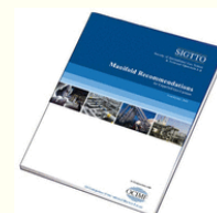
Manifold Recommendations for Liquefied Gas Carriers OCIMF (Oil Companies International Marine Forum), SIGTTO