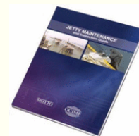
Jetty Maintenance: And Inspection Guide SIGTTO, OCIMF (Oil Companies International Marine Forum)