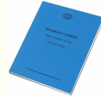
Disabled Tankers: Report of Studies on Drift & Towage Ocimf